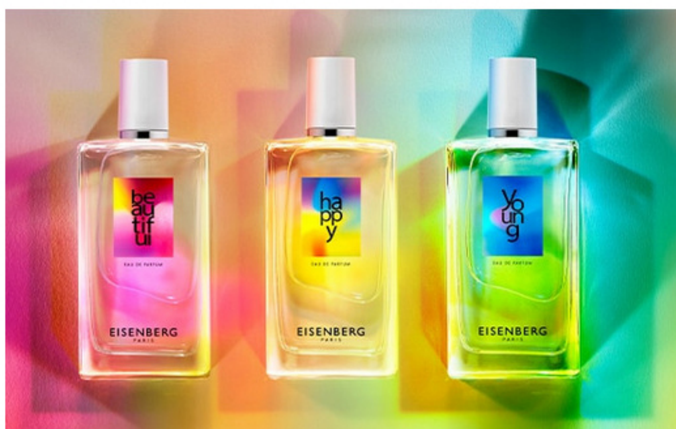
Beautiful , Happy and Young Perfumes (59€)

The brand wants to highlight the positivity of each one through these light, inspiring and refreshing aromas, divided into three perfumes.